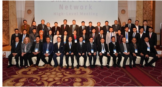
Guests from ASEAN and ASCN