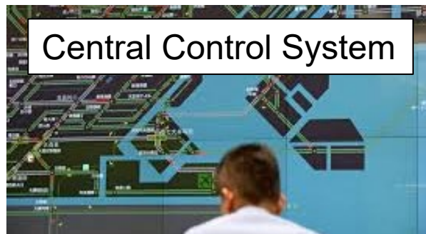
Central Control System